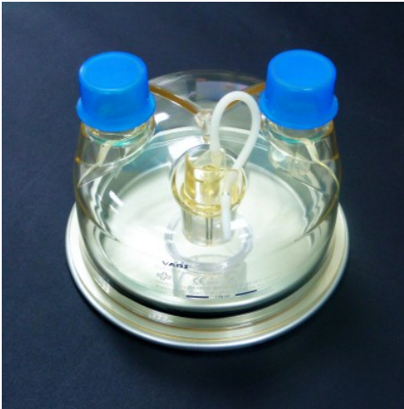
G-314002 - Adult/Pediatric Chamber