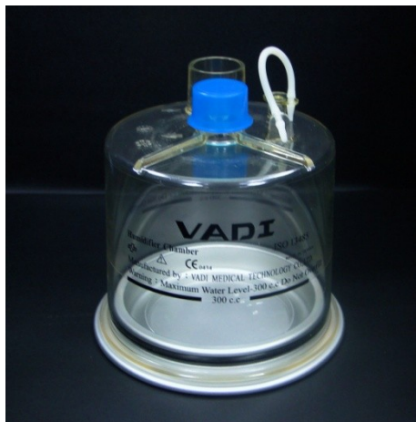
G-314003 - Adult Chamber