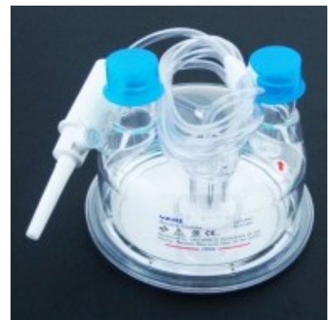
G-314001 - Adult/Pediatric Chamber (Disposable)