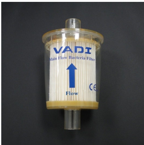
800-51500 - Bacteria Filter