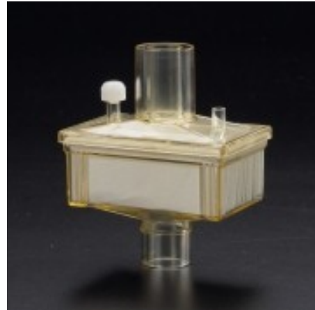
800-51900 - Bacteria Filter